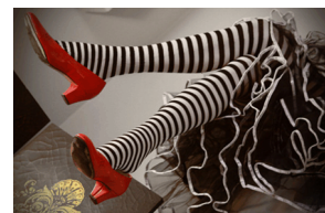
Who said socks don't matter?